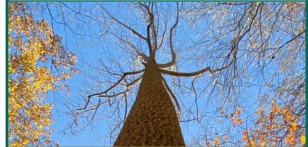
Tulip Tree on a Fall Morning

Eno Preserve Mt. Archer Woods Pickwick's Preserve